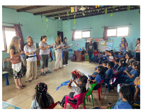
The awesome gals from Redeemer with Pre-K kiddos in Guatemala