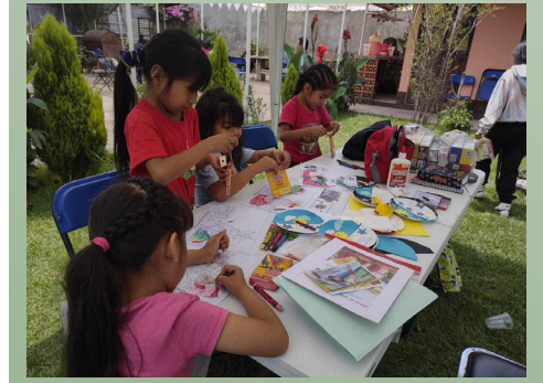
Mexico City Summer Bible School